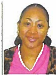
London Basic Nursing