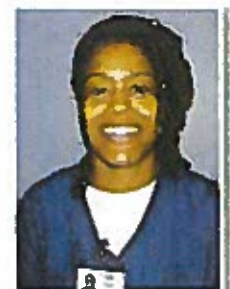
Maria Practical Nursing

Visit our website for information regarding graduation rates, median debt of students and other information